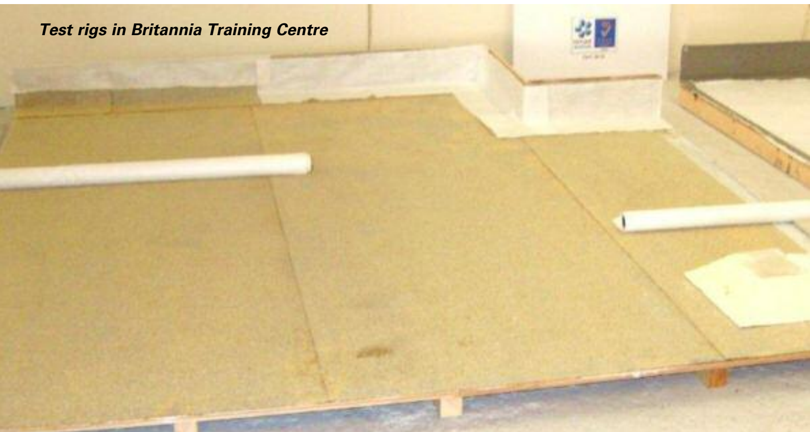
Test rigs in Britannia Training Centre

IT IS GOOD PRACTICE TO INSPECT AND CARRY OUT ADHESION TESTS ON ANY EXISTING COATING OR SUBSTRATE PRIOR TO APPLICATION OF THE COATING.